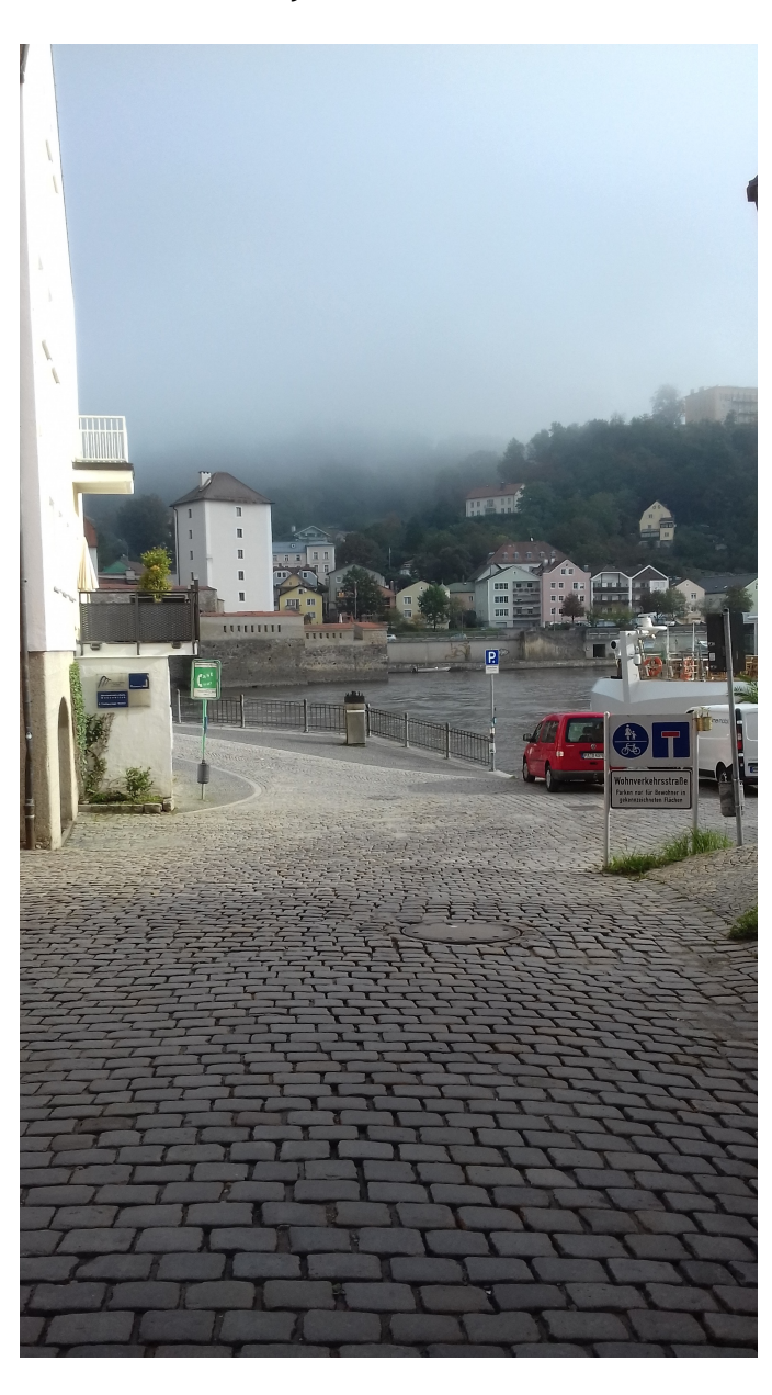
Page 2 of 8

We left about ten in the morning reaching the Austrian border in a few minutes, where you're obliged to buy a motorway toll sticker from a bleak, inhospitable kiosk staffed by a ferocious lady with a very serious haircut and attitude sharp enough to reduce Romanian truckers to tears. Grown men were queueing in silence, hoping their turn would never come. She certainly scared me, and her staccato "ACHT"